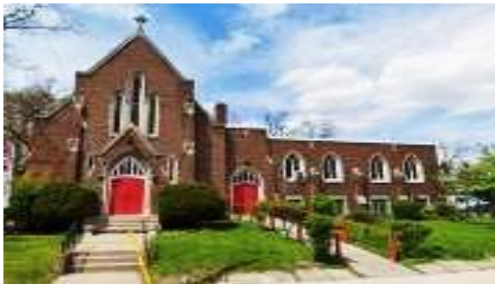
Don Mills United Church 126 O'Connor Dr. The church, which was first registered in 1819. In 1950, the smaller church was demolished to build the larger church as it now stands today.