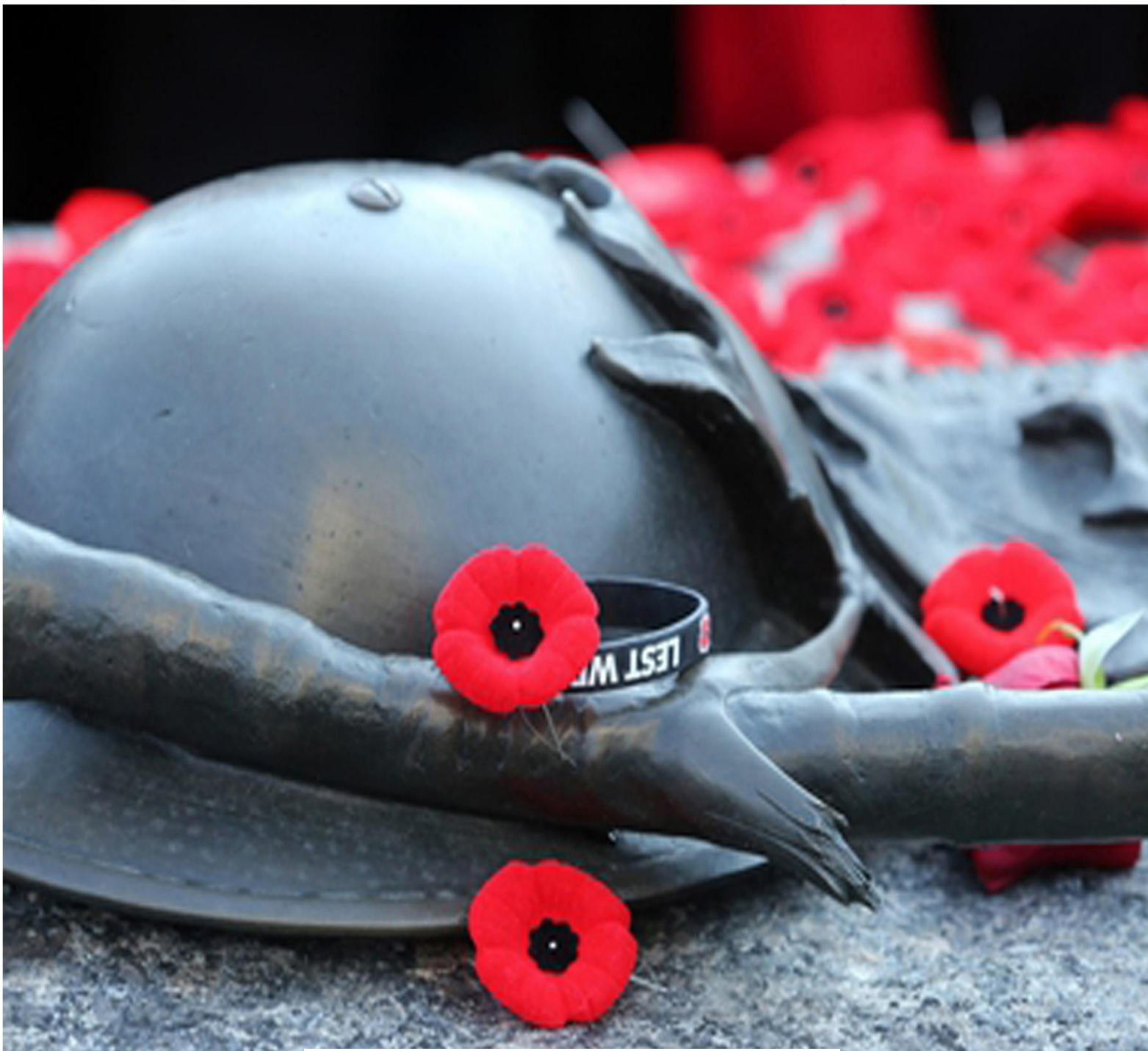
I Vow To Thee My Country - Festival of Remembrance

Newsletter of East York Historical Society Volume 16 Issue 5 November 2020