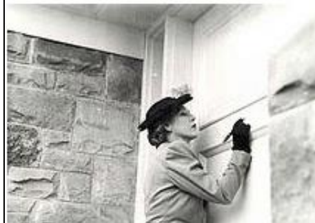
Photo of Silent Screen Actress Mary Pickford Autographing her signature on the outer wall of her East York House (date unknown).