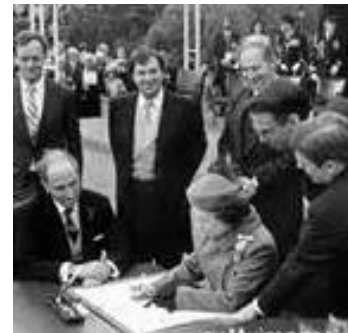
Photo of Former Prime Minister Elliot Trudeau and the Queen signing the Charter of Rights and Freedom. 35 years ago, Canada patriated our constitution and adopted our Charter of Rights and Freedoms

On November 11 th , on behalf of the East York Historical Society, I laid a wreath at the East York Civic Centre cenotaph. It was inspiring to see such a great turnout at this important ceremony.