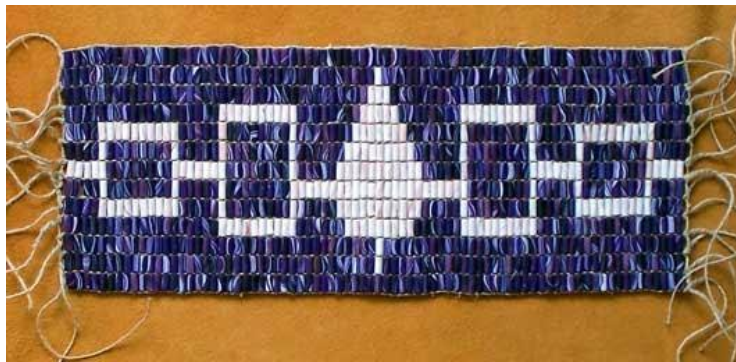
ONE of MANY TYPES of WAMPUM BELTS

We acknowledge this sacred land on which the East York Historical Society meets. It has been a site of human activity for over 15,000 years. This land is the territory of Haudenshantee, the Huron-Wendat and Petun First Nations , the Seneca and most recently the Mississaugas of the New Credit. This territory was the subject of the Dish with One Spoon Wampum Belt Covenant, an agreement between the Iroquois Confederacy and the Confederacy of the Ojibwa and allied Nations to peaceably share and care for the resources. Today the meeting place of Toronto is still the home to many Indigenous people from across Turtle Island and we are grateful to have the opportunity to work in the community on this Territory.