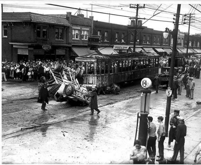
City of Toronto Archives, Fonds 1244, f1244_r1156