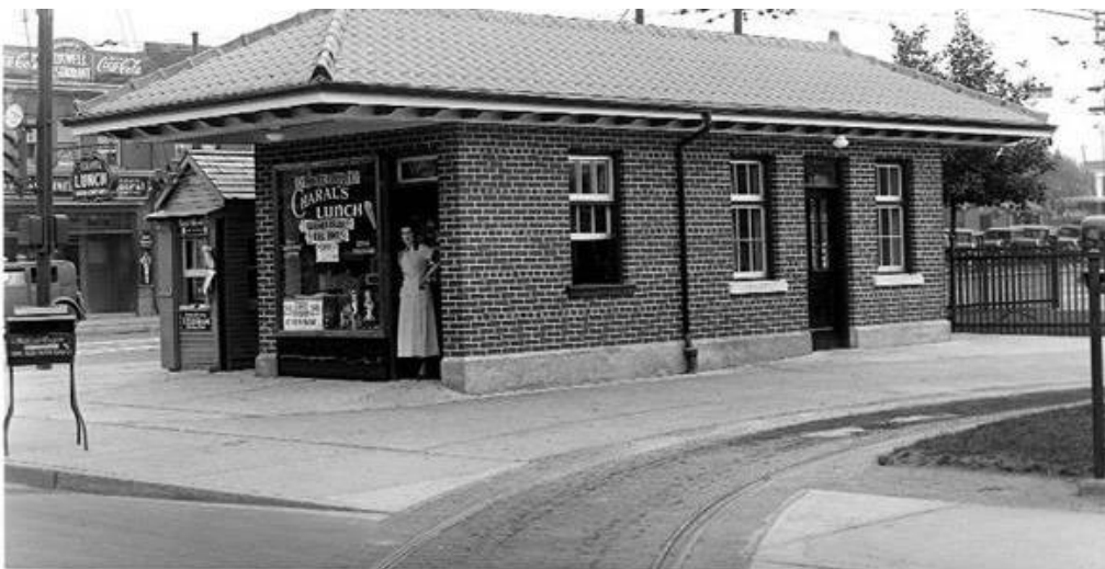
11485 T.T.C. Waiting Room, Danforth and Coxwell Avenues. (Bldgs.) Aug. 4, 1936.