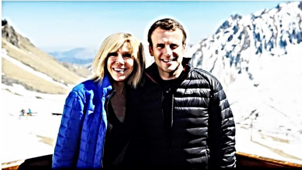
Emmanuel Macron (and wife Brigitte). Macron's youngest President of France, May 7, 2017