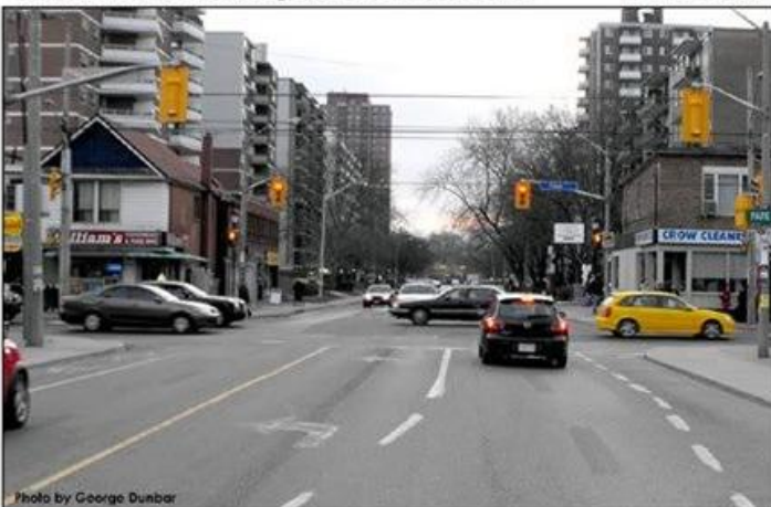
Cosburn Ave. looking west at Pape Ave. 1911 & 2009