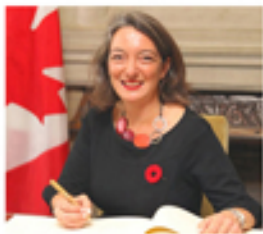
EYHS Congratulates MP Julie Dabrusin

2020 has been off to a great start! The new 43rd Parliament has officially begun. I was honoured to be asked by the Prime Minister to serve as the new Parliamentary Secretary to the Minister of Canadian Heritage, Steven Guilbeault (pictured along with Adam van Koevorden, PS to Sport). You can check out all Minister mandate letters online; they are a great place to learn about the priorities on which the Ministers will be working.