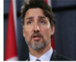
PM Justin Trudeau being interviewed

Ukraine International Airlines Flight PS752 January 8, 2020 176 passengers and crew