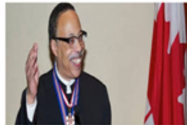
Poet Laureate George Elliott Clarke