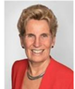
MPP., K. Wynne Former Premier of Ontario.